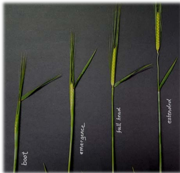
Applications of fungicide targeting FHB should be made when most of the heads are at full-head (similar to the third head from the left).