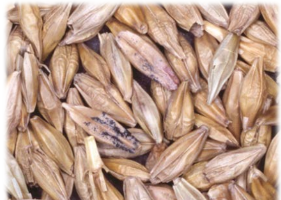
Infected kernels may be shrunken and appear bleached or pinkish in color; and eventually may take on a sooty appearance

Fungicide use is encouraged as it may reduce the severity of FHB by 20 to 50 percent and DON levels by 40 to 60 percent, although actual reductions are highly variable. Using recommended fungicides also tends to boost yields by significantly reducing the severity of various leaf diseases common to barley. To improve effectiveness of a fungicide application against FHB: